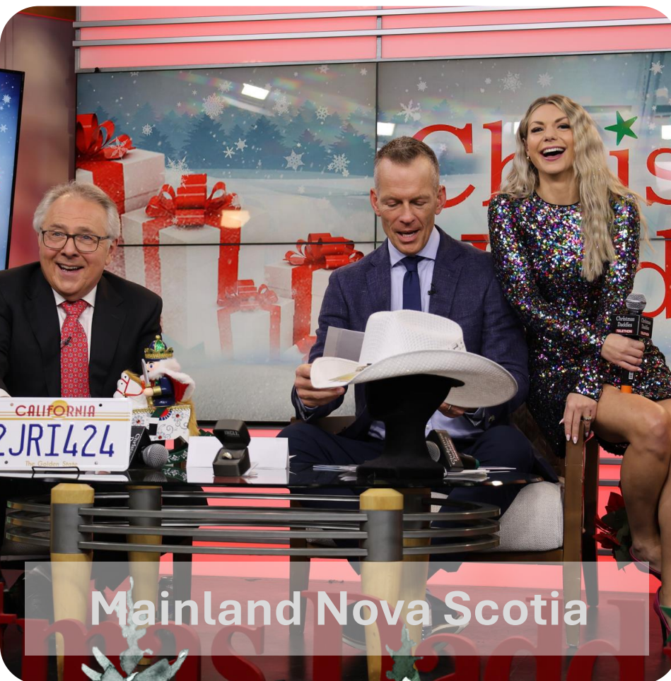
Mainland Nova Scotia