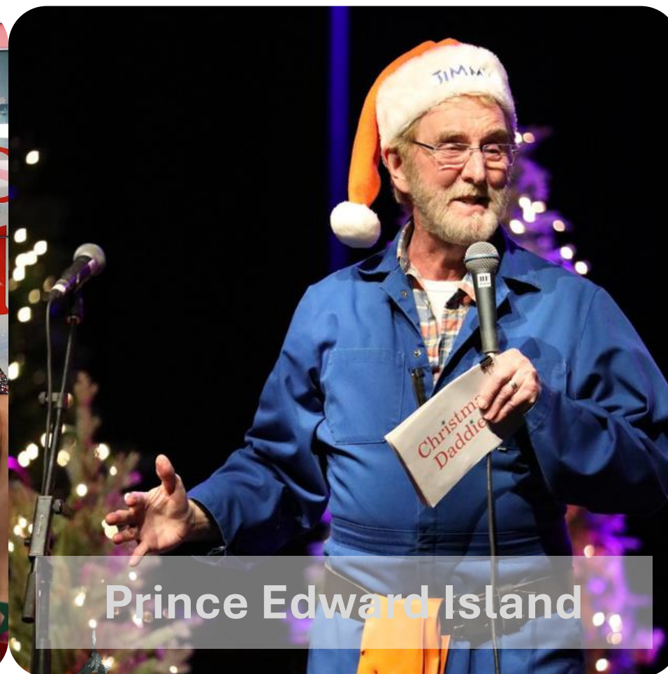
Prince Edward Island